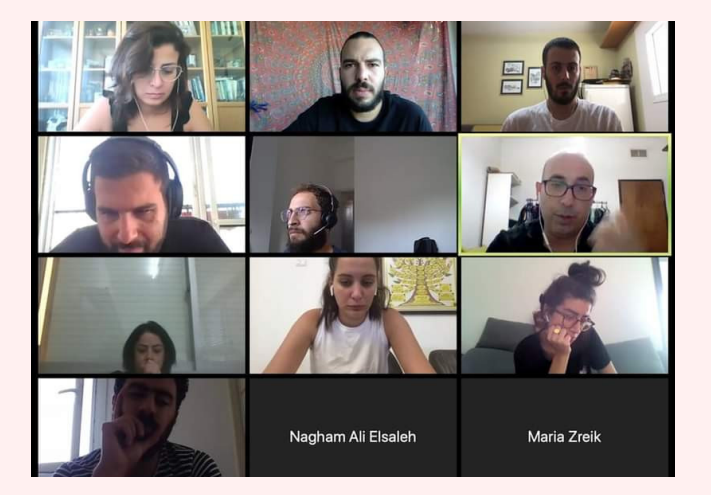
A Zoom meeting for the activists involved in planning and coordinating the Center's activities