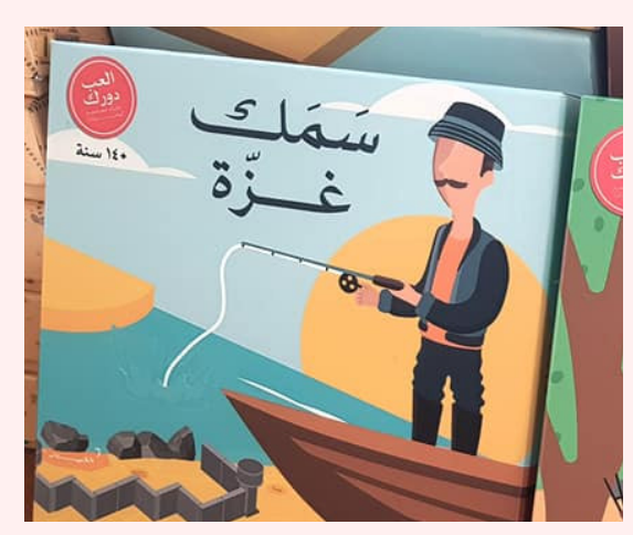
A board game developed by Baladna that will be adapted for the online platform

Since 2017, Baladna, Palvision, and the American Friends Service Committee (AFSC) have worked together to overcome barriers, stereotypes, and fragmentation between Palestinians in the West Bank, Jerusalem, and the 48 regions. In the past, we have done so primarily through regular exchanges between youth in each of the three geographic areas. Restrictions on movement and safety concerns resulting from Covid-19, however, threw a wrench in our plans for 2020. To adapt to the new reality, we have been working with Palvision and AFSC to develop an online platform that addresses the same themes as our exchanges. The platform, which we plan to launch this spring, includes a video page for interactive events, a library with content on Palestinian identity and fragmentation, electronic games that address fragmentation and the Palestinian cause, and virtual tours of various Palestinian locales in the West Bank, Jerusalem, Gaza, and the 48 regions.