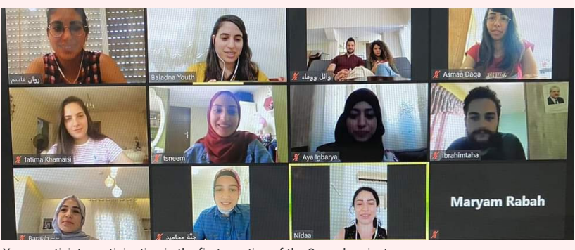
Young activists participating in the first meeting of the Sumud project

The Sumud project responds to the geographic, social, and political fragmentation of the Palestinian people through the promotion of a common vision and unified collective action among Palestinian youth from different regions. In cooperation with Youth of Sumud, which is located in the Southern Hebron Hills (Area C), the project involves a series of sessions during which thirty young activists from the West Bank and the 48 regions will get to know one another, jointly explore issues relating to fragmentation and the occupation, develop a collective identity, and devise joint strategies to overcome fragmentation and promote Palestinian rights. During the first meeting, which took place over Zoom, the two groups had the chance to get to know one another and set their expectations for the upcoming experience. The next meeting will take place in the West Bank on March 20th.