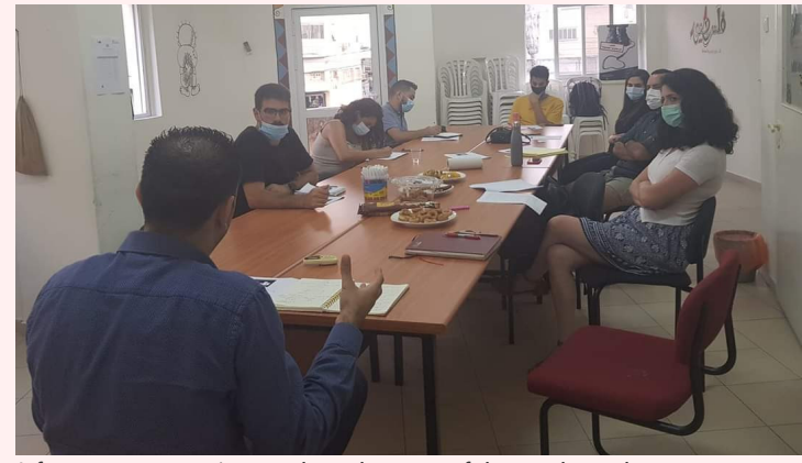
A focus group meeting conducted as part of the youth needs assessment

The Harak Youth Leadership project aims to Arab Palestinian empower vouth transformative agents of change by providing them with skills and frameworks to develop and implement action plans that will generate tangible, needs-responsive results. The project places youth at the center of all stages of the social change process, enabling them to identify their own needs, priorities, and strategies. Baladna's role is simply to provide structure and guidance as the youth take the lead in advancing their rights and the well-being of their communities.