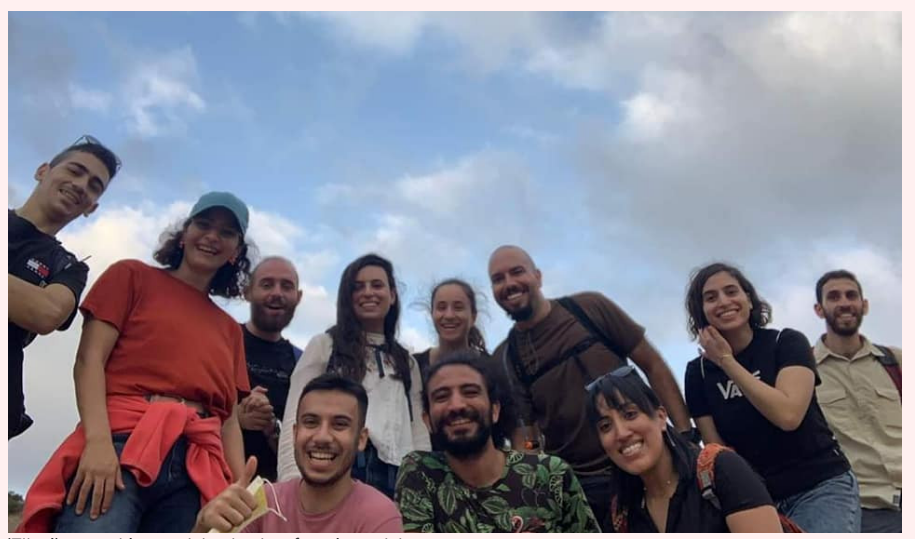
'Tijual' tour guides participating in a four-day training camp