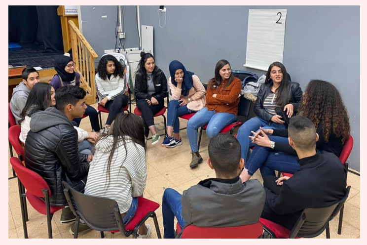
Harak youth activists participating in a two-day workshop prior to the spread of Covid-19

Our needs assessment marks the first time that youth in the Arab Palestinian society have been mobilized to investigate their own needs. It is also the first study of Arab Palestinian vouth to take place since Baladna conducted its last needs assessment in 2012. Once published, the needs assessment will serve as a guiding resource for civil society organizations, educators, social workers, and policymakers working to advance the rights and well-being of Arab Palestinian youth. It will also serve as a resource for youth involved in Baladna's projects. Most notably, youth involved in the Harak project will use the findings to design and implement their own social change action plans with the aim of generating sustainable services and policies that address the needs of young people as they themselves have identified them