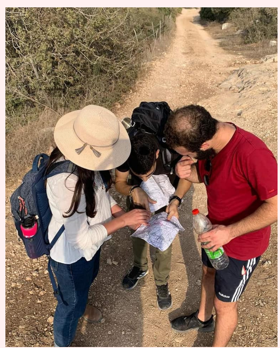
'Tijual' tour guides participating in a four-day training camp